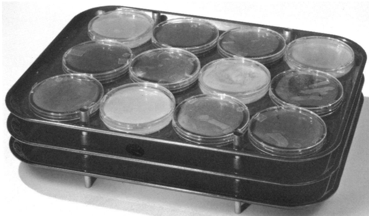
FIG. 1. Stack of three tray-racks, showing placement of culture dishes on tray.

Although the trays may be stacked as high