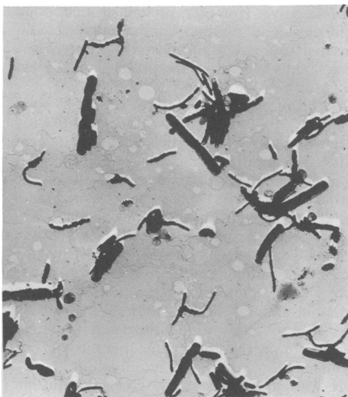
FIG. 1. Electron micrograph of the thermophilic mixed population of bacteria grown on a methanol-mineral salts medium at 56 C. Magnification, 2,436 \times .