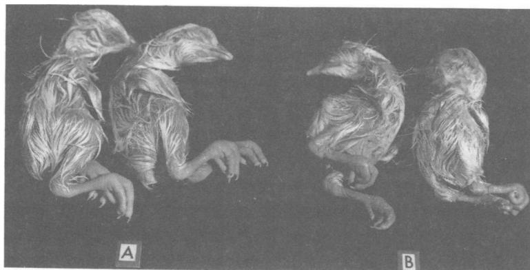
FIG. 2. Teratogenic effects in chicken embryos from citrinin administration. (a) Control; (b) citrinin (note heads twisted to left).