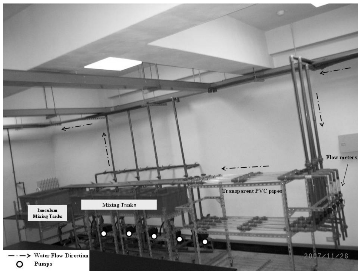
FIG. 1. Model plumbing system.

tenance period, unlike the result with P. aeruginosa . The same Cu/Ag concentrations tested achieved 99.9% killing of biofilm-associated A. baumannii in 12 h (Fig. 2e). Only Cu/Ag concentrations of 0.8/0.08 mg/liter maintained complete inactivation in the first 72 h. Cu/Ag concentrations of 0.4/0.04 and 0.8/0.08 mg/liter achieved complete inactivation of plankton-associated A. baumannii in the first 72 h (Fig. 2f). Less than 1 log regrowth was observed with both biofilms and planktonic samples for A. baumannii , unlike the finding for P. aeruginosa . S. maltophilia appears to be more susceptible to copper and silver ions than P. aeruginosa and A. baumannii .